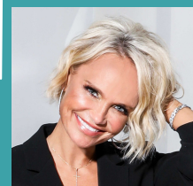
Kristin Chenoweth Tony winner, "You're a Good Man, Charlie Brown"