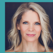
Kelli O'Hara Tony winner, The King and I