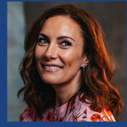
Laura Benanti Tony winner, Gypsy