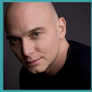
Michael Cerveris Tony winner, Fun Home