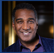
Norm Lewis Tony nominee, Porgy & Bess